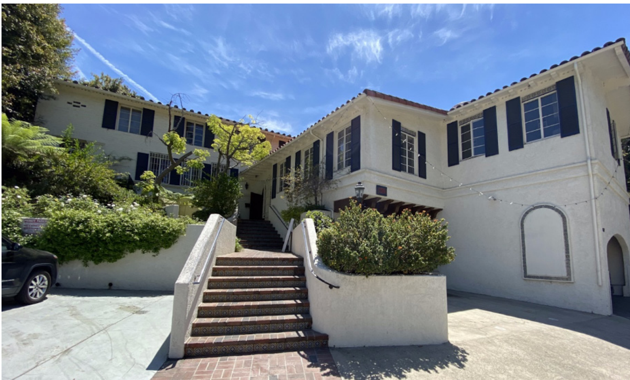
Opportunity House in Westwood, CA

The Los Angeles Community College District has established partnerships and a Memorandum of Understanding (MOU) with two nonprofit community-based organizations to provide emergency housing to needy students. End Homelessness California (operating as Shower of Hope) provides 12 housing slots to East Los Angeles College students. Similarly, the Los Angeles Room and Board program (LARNB) places 35 low-income homeless community college students in transitional housing at Opportunity House in Westwood, CA. Shower of Hope has agreed to waive the monthly rental fee if students volunteer at a local community-based organization. And both nonprofits have decided that students will not be removed for failure to pay. The estimated cost to house each student is approximately $10,000 per academic year, including room, board, and wrap-around services and costs.