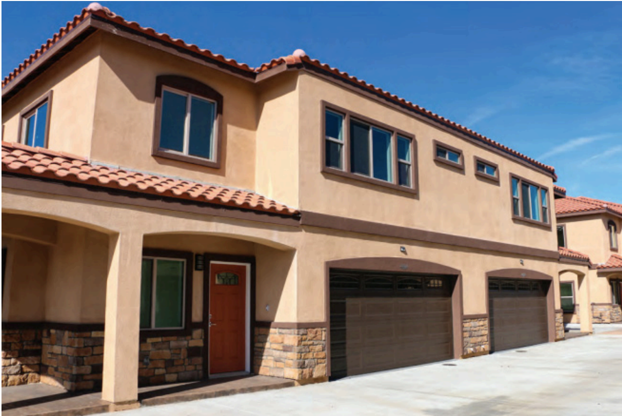
The Village

Cerritos College has adopted another smaller-scale approach. The Village is a seven-townhome development adjacent to its campus that the college purchased to house homeless students. The project hails as the first-ever community college project designed for homeless students operated in partnership with Jovenes Inc., a Los Angeles based nonprofit provider of housing services for displaced young adults and the homeless. Students pay rent at reduced prices or live rent-free, depending on their eligibility criteria.