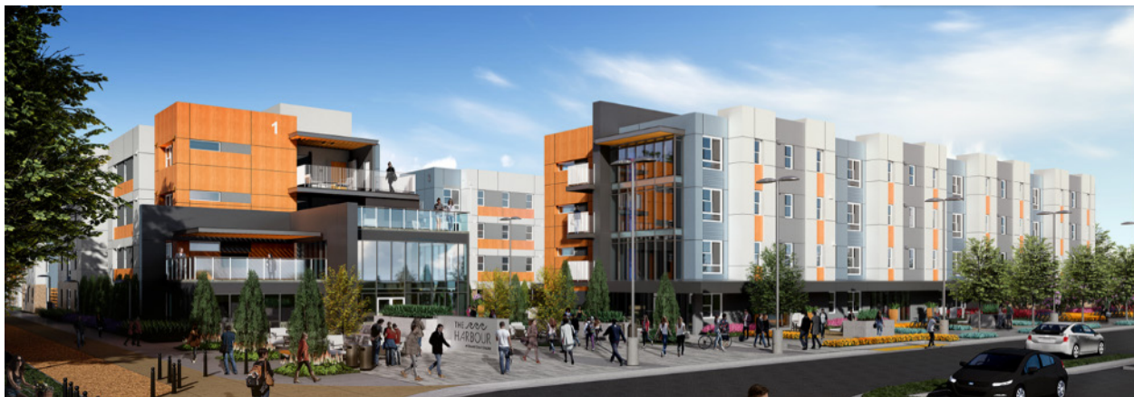
The Harbour

Some community colleges have had success establishing residence halls or living spaces for students using PPP projects. For example, Orange Coast College turned to a PPP funding mechanism and The Scion Group, privately-held owner/operator of student housing communities in the United States, to operate its new 800-bed residence hall called The Harbour at Orange Coast College. Opened in the fall semester of 2020, The Harbour provided options for different apartment living types, and the college offered one-time financial assistance for eligible students at $400/month reductions. A similar project is underway at Santa Rosa Junior College , with plans for a 400-bed residence hall on the college's main campus. The project is expected to break ground in June 2021 and be completed for fall 2023 occupancy. The Santa Rosa Project includes a partnership with the county housing authority to provide some subsidized housing to non-students.